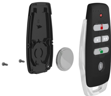
Figure 2 – Replacing the REM25 Battery

This product contains a coin cell battery. If the coin cell battery is swallowed, it can cause severe internal burns in under two hours and can lead to death.