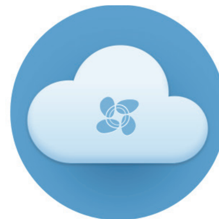
Encrypted Cloud Storage