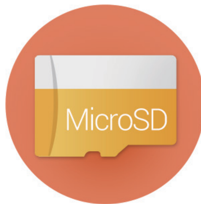
Supports MicroSD Card

Save your recordings with flexible and secured solutions. The DB1 comes with a built-in MicroSD card slot that can store up to 128 GB of recorded footage. You can also save your images to EZVIZ Cloud for additional back-up. (The EZVIZ CloudPlay is only available in the US, UK and Europe)