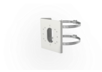
DS-1275ZJ-S-SUS Vertical Pole Mount