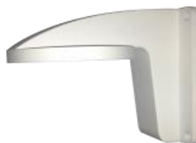
Indoor wall mount DS-1258ZJ