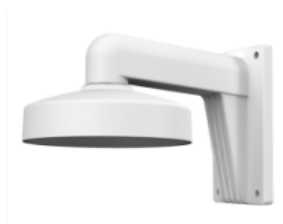
Indoor/outdoor wall mount DS-1272ZJ-110