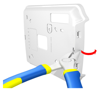
Figure 2: Surface-mount cabling plastic tab removal

4. Mount the backplate to the wall by securing a M3.5 #6 screw in each of the dedicated mounting holes and tamper hole while ensuring that the top is up, as shown in Figure 3. For EN installations, use the designated mounting holes (#3).